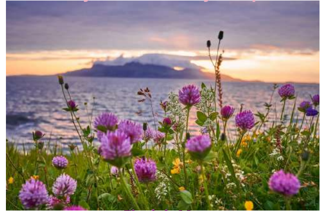
Fjords in May

General Meeting: There is NO meeting this month, instead we have our Field Trip to the Oregon Gardens on May 16 (see page 2). A reminder will be sent on or near Wed. May 13.