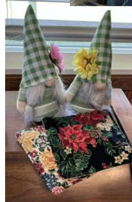
Doorprizes: gnomes & jar openers